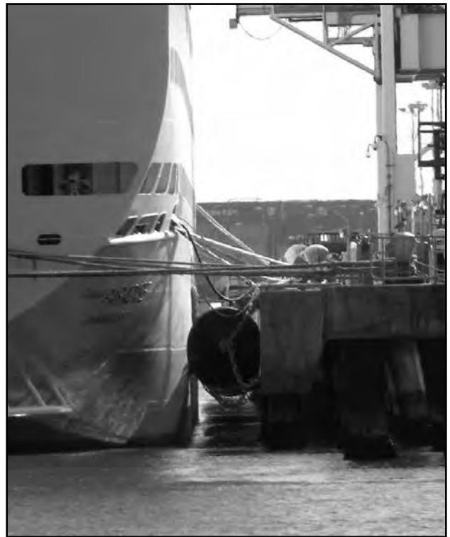
GENERIC PERFORMANCE CURVE OCEAN GUARD FENDER