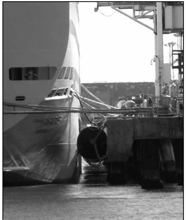
GENERIC PERFORMANCE CURVE OCEAN GUARD FENDER